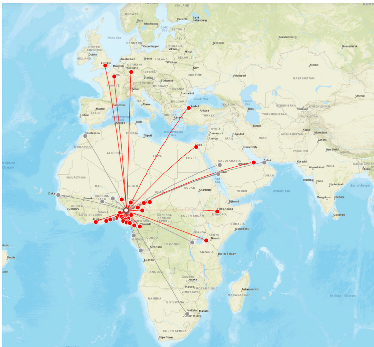
Direct flights from Abuja

Due to its central location, almost all hotels in Abuja can be accessed very easily from the Transcorp Center Abuja, from Transcorp Hilton Abuja which is in the same premises to hundreds of other hotels listed on Aura by Transcorp Hotels.